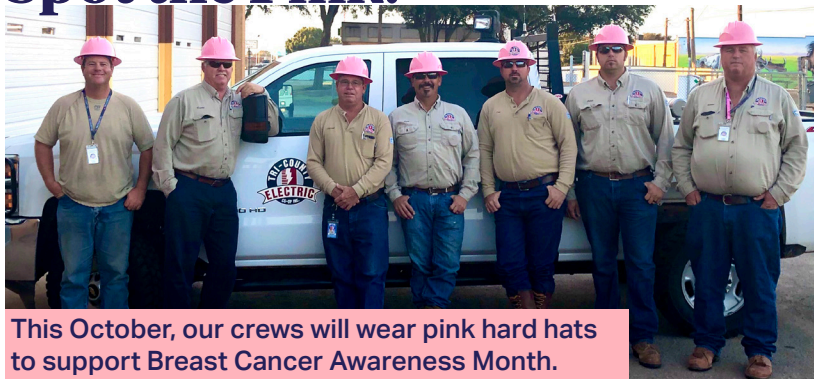
This October, our crews will wear pink hard hats to support Breast Cancer Awareness Month.