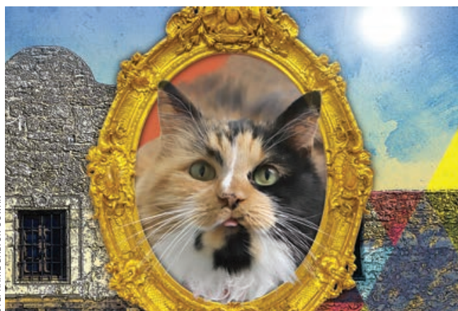
STEPHANIE DALTON COWAN